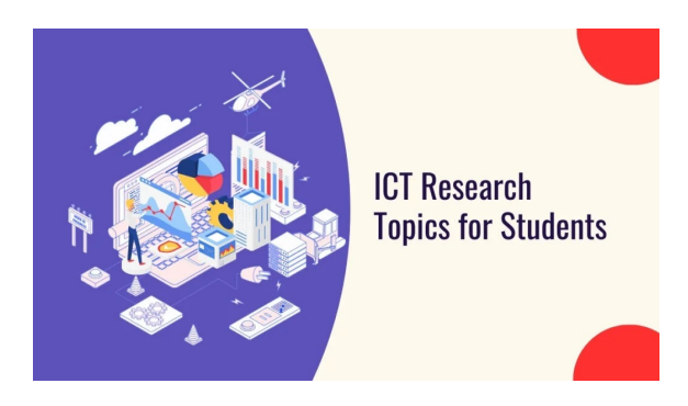
Top & Trending 60 ICT Research Topics for Students